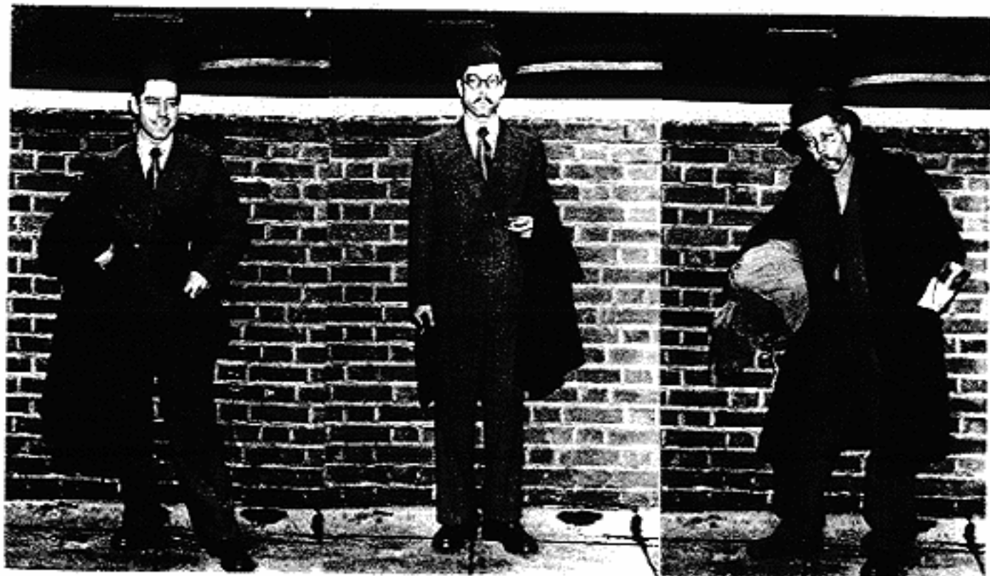
Three photographs showing how differences in height, weight, posture, character and age are achieved quickly.